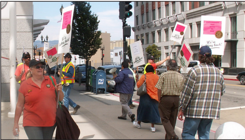
Members rally in Oakland.