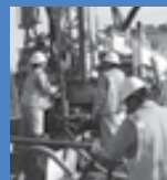
Levee Repairs Page 15